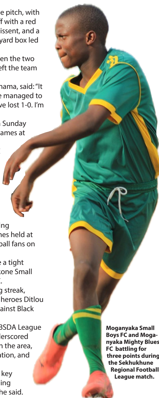
Moganyaka Small Boys FC and Moganyaka Mighty Blues FC battling for three points during the Sekhukhune Regional Football League match.