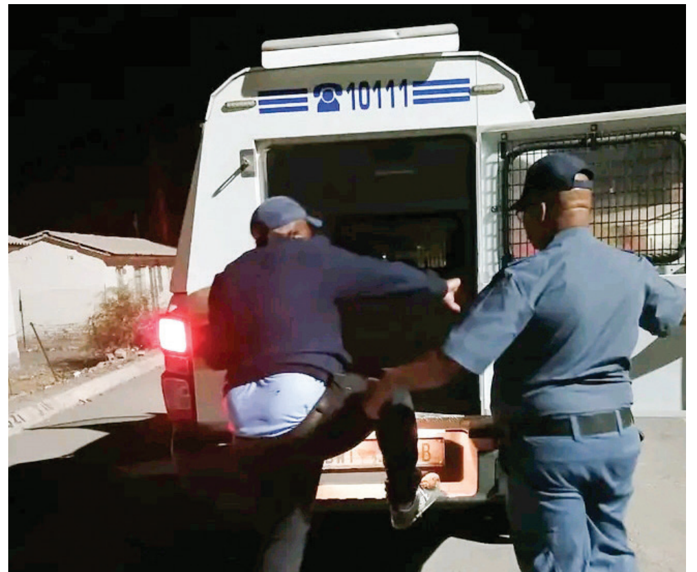
The police in Motetema have arrested seven suspects following a mob justice murder incident that occurred in Masakaneng Village outside Groblersdal.

MASAKANENG - Seven male suspects, aged 18 to 40, have been taken into custody following a deadly mob justice incident in Masakaneng outside Groblersdal the police said.