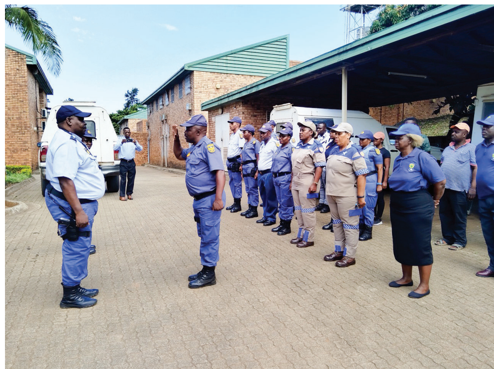
Limpopo Police members gearing-up for the Operation Shanela which resulted in the arrests of 792 suspects across the province.

SEKHUKHUNE - The police in Limpopo wrapped up a week-long high-density operation dubbed Operation Shanela, arresting 792 suspects and recovering four firearms across the province's five districts.