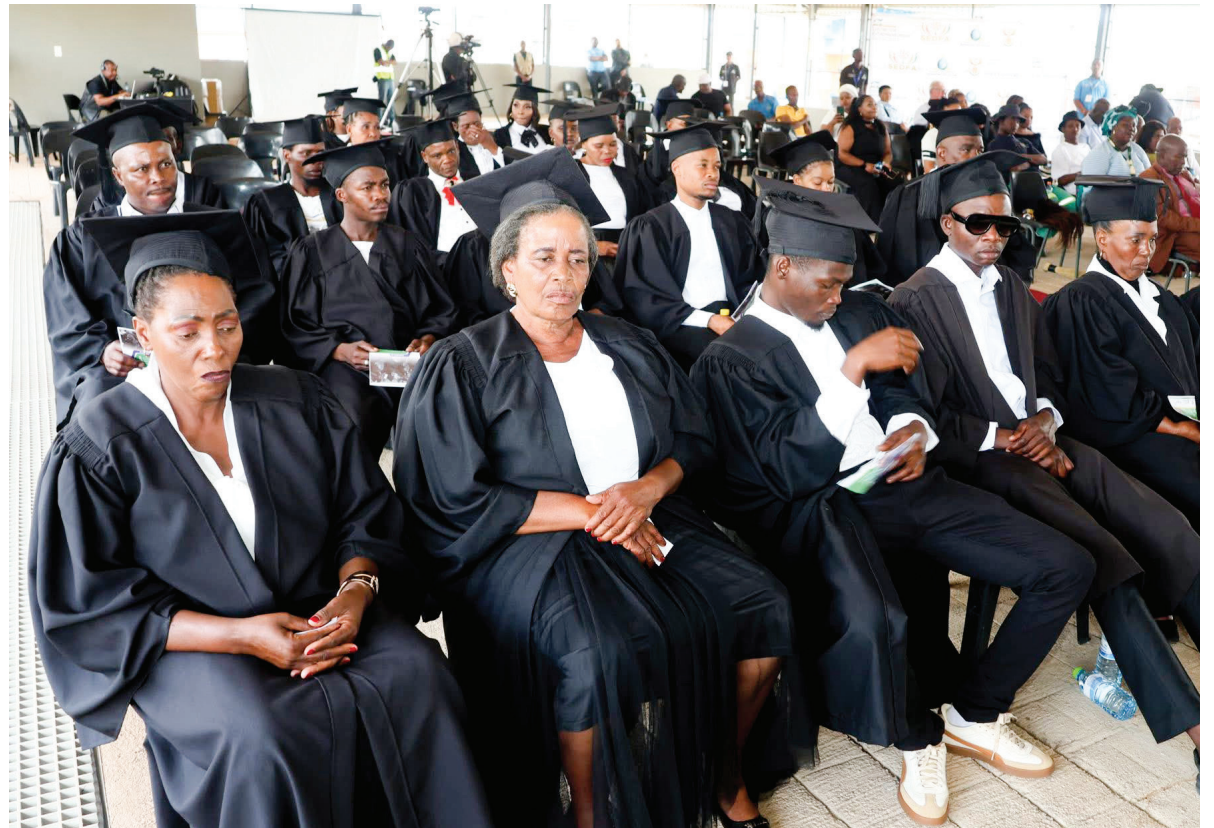
The hawkers received their certificates from Sekhukhune TVET College after completing a specialised programme in Small Business Ownership and Financial Management.

GROBLERSDAL - Sekhukhune TVET College, in collaboration with the Elias Motsoaledi Municipality (EMLM), conferred certificates to 38 hawkers who completed a specialised programme in Small Business Ownership and Financial Management.