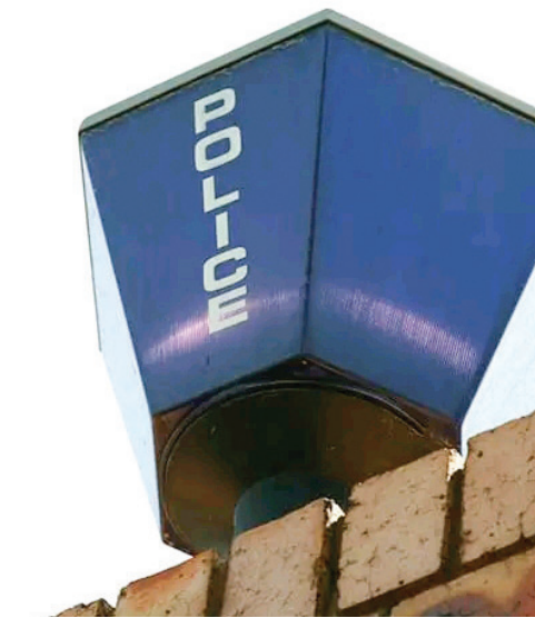
The Groblersdal Regional Court has sentenced a Dennilton serial rapist to life imprisonment for the rape of a 15-year-old girl.

and emotional trauma experienced by both the victim and the rape victim was severely affected to the point that she had to drop out of school, and she constantly lives in fear that the accused might harm her again.