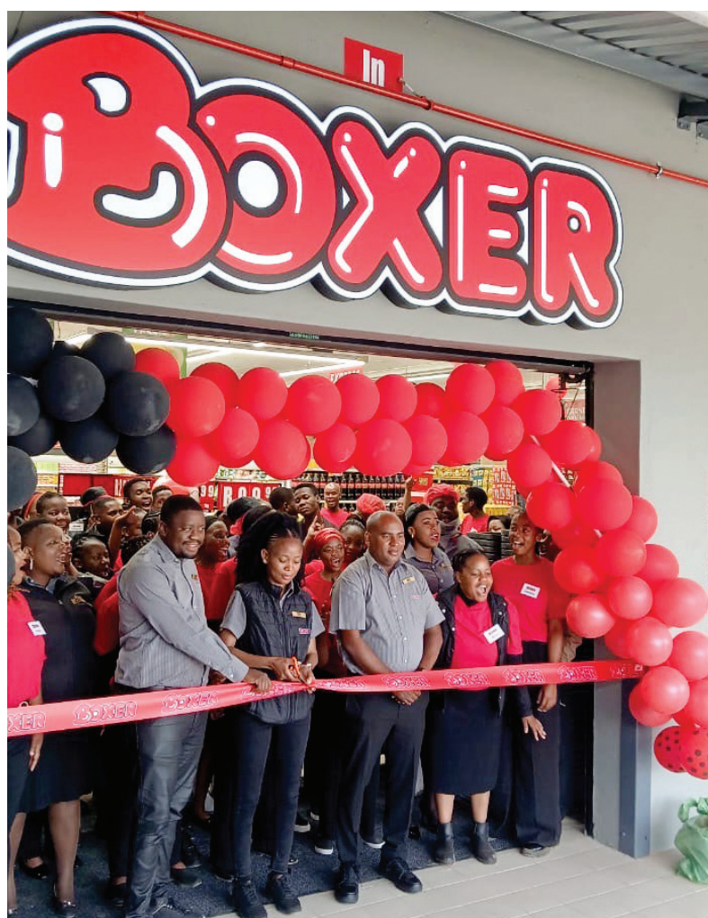
The Boxer Superstores Jane Furse team cut the tradition red ribbon – signaling the start of more savings, and excellent service for shoppers!