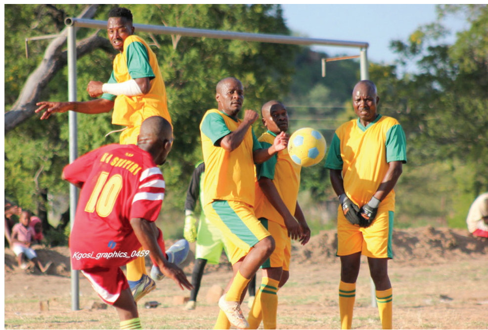
0459 United 11 in action with South African Brewery during the Masters friendly matches.

0459 United 11 FC was among teams taking part in the Masters Games on Sunday 23 November 2025.