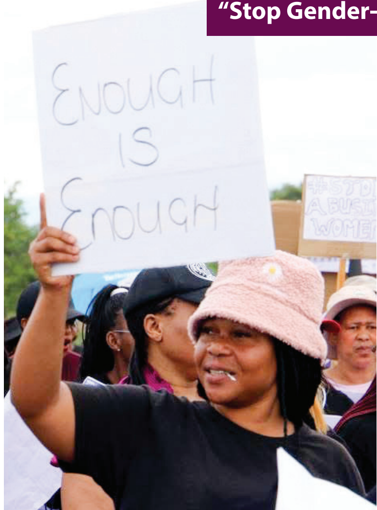
SDM employees, joined by other stakeholders, marching against GBVF in Groblersdal.