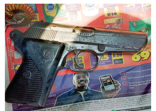
One of the four unlicensed firearms which were recovered by the police during the operations.